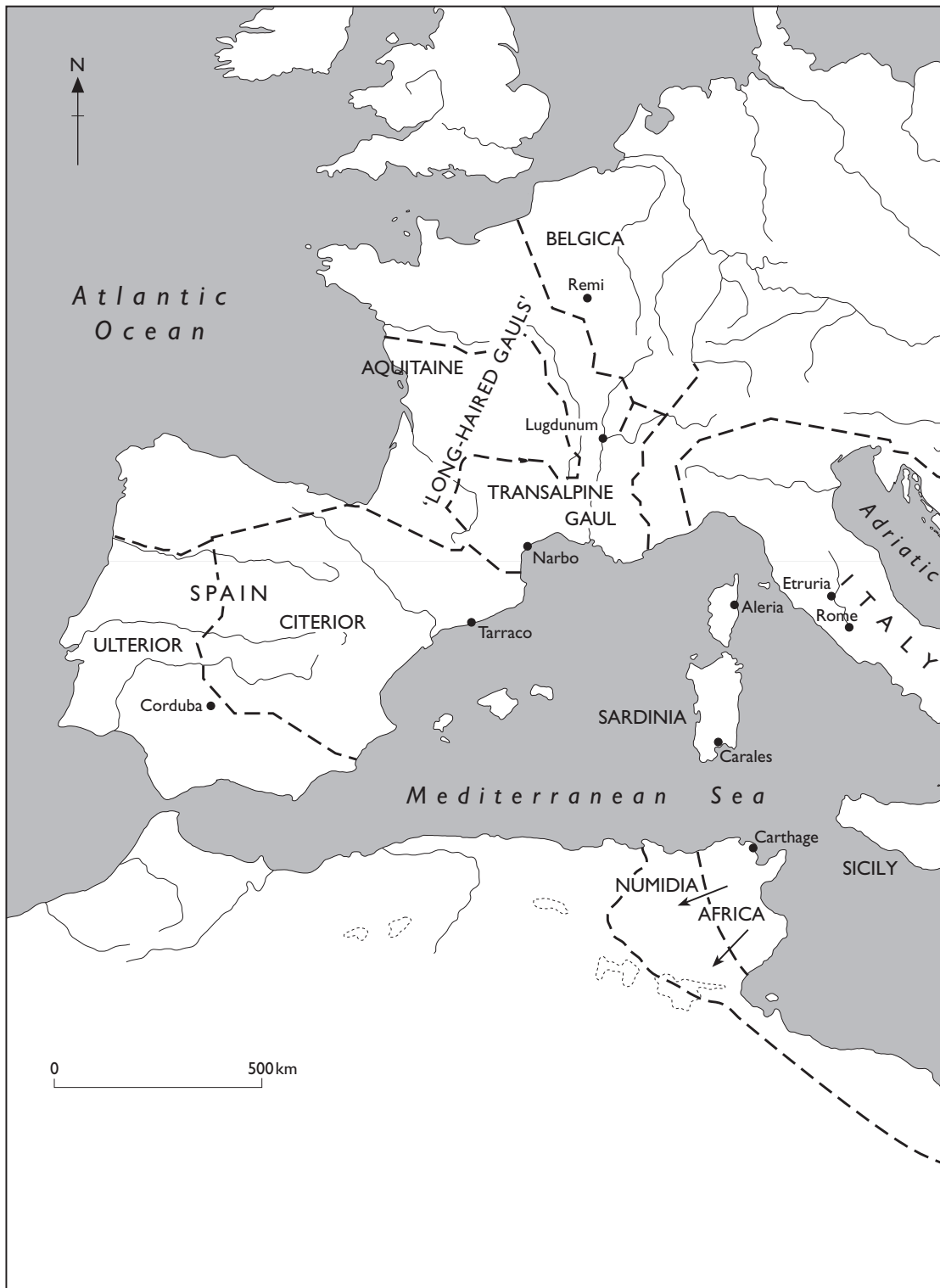
Map 7.1. The Roman Empire in 27 BCE.