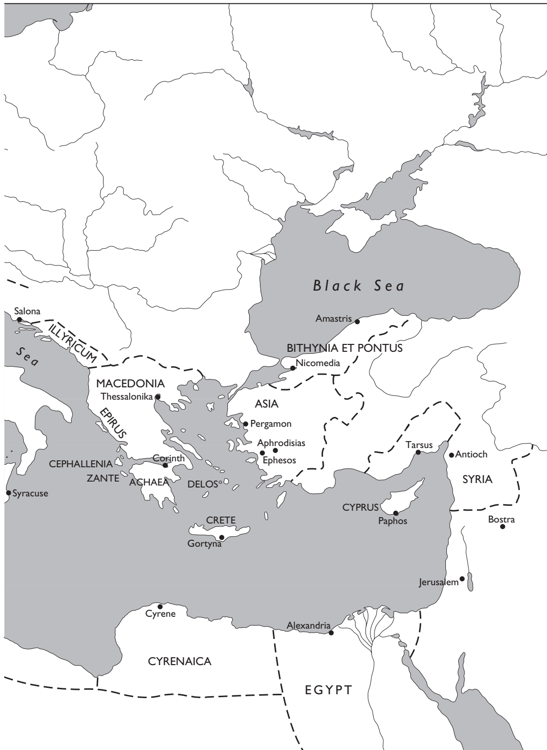
Map 7.1. (cont.).